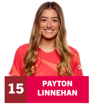
TOTAL NWSL STATS GAMES PLAYED: 0 GAMES STARTED: 0 GOALS: 0 ASSISTS: 0