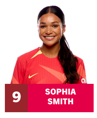
TOTAL NWSL STATS GAMES PLAYED: 41 GAMES STARTED: 35 GOALS: 11 ASSISTS: 7